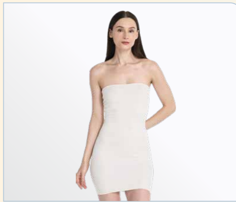
AS062 Body Wrap - Ivory, 70cm x 27cm