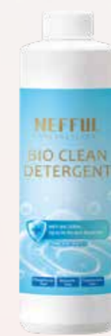
NS006 Bio Clean Detergent