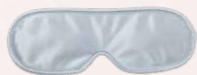
AS049 Eye Mask