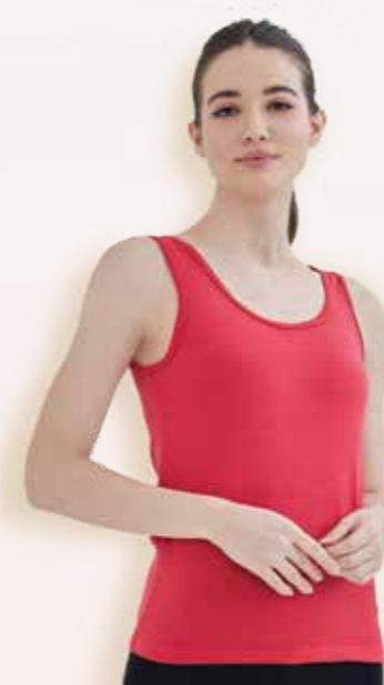
UW622 Lady's Sleeveless Undershirt