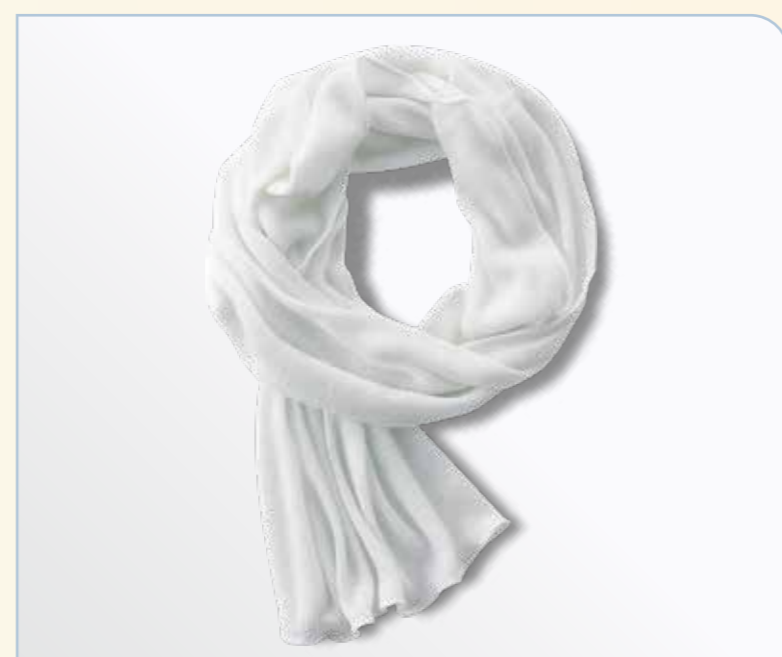
AS002 Cloth - White