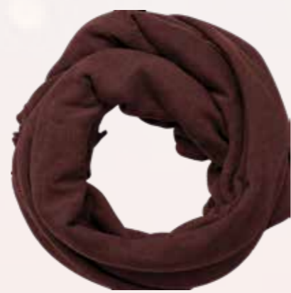
AS065 Square Scarf