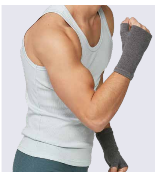
SG013 Wrist Support (1 Pair/Pk)

^ Net payable amount: approximately RM4,860