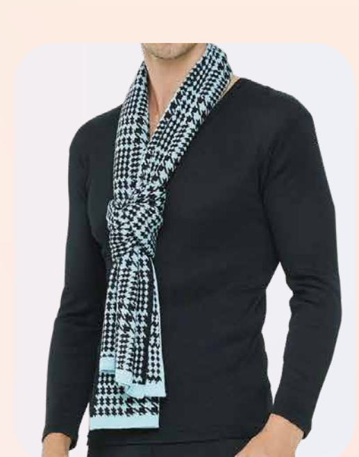
AS042 Houndstooth Plaid Patterned Shawl