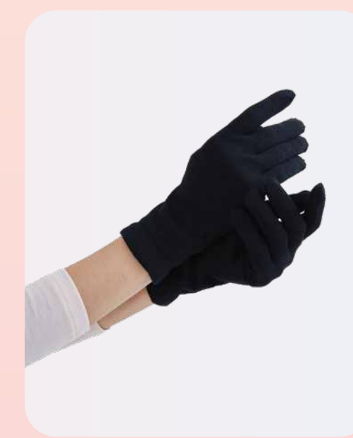
AS017 Women's Gloves