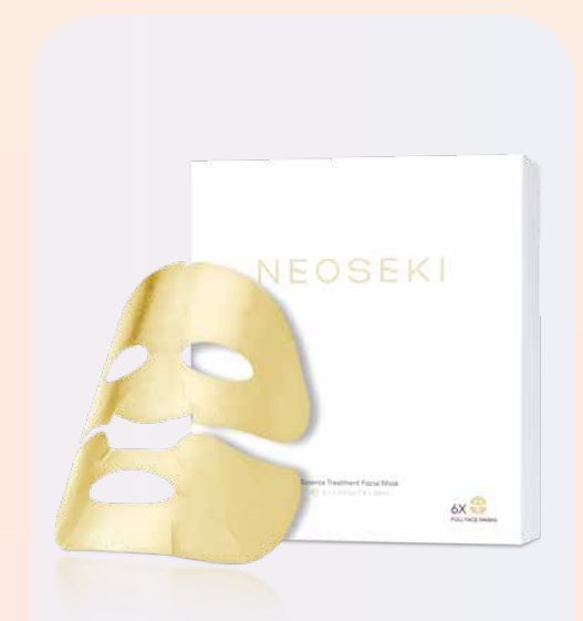
BW104 Essence Treatment Facial Mask - 30ml x 6pc