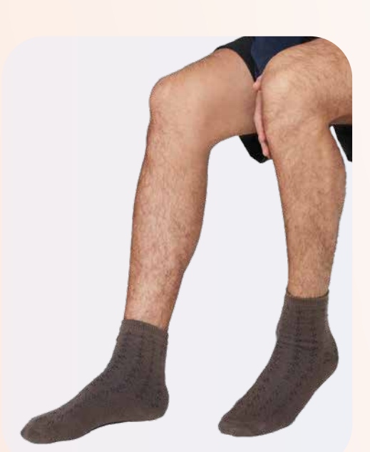
LS005 Room Socks