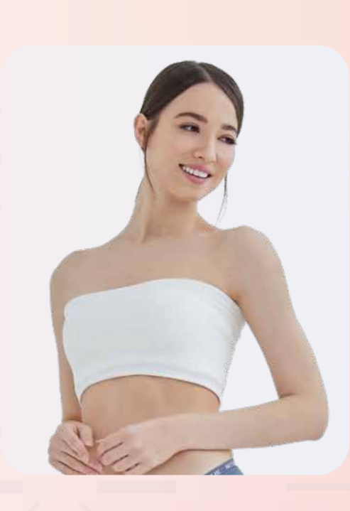
AS012 NEORON® Body Wrap