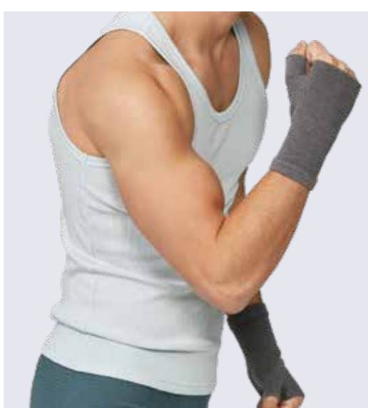
SG013 Wrist Support (1 Pair/Pk)

^ Net payable amount: approximately RM4,860