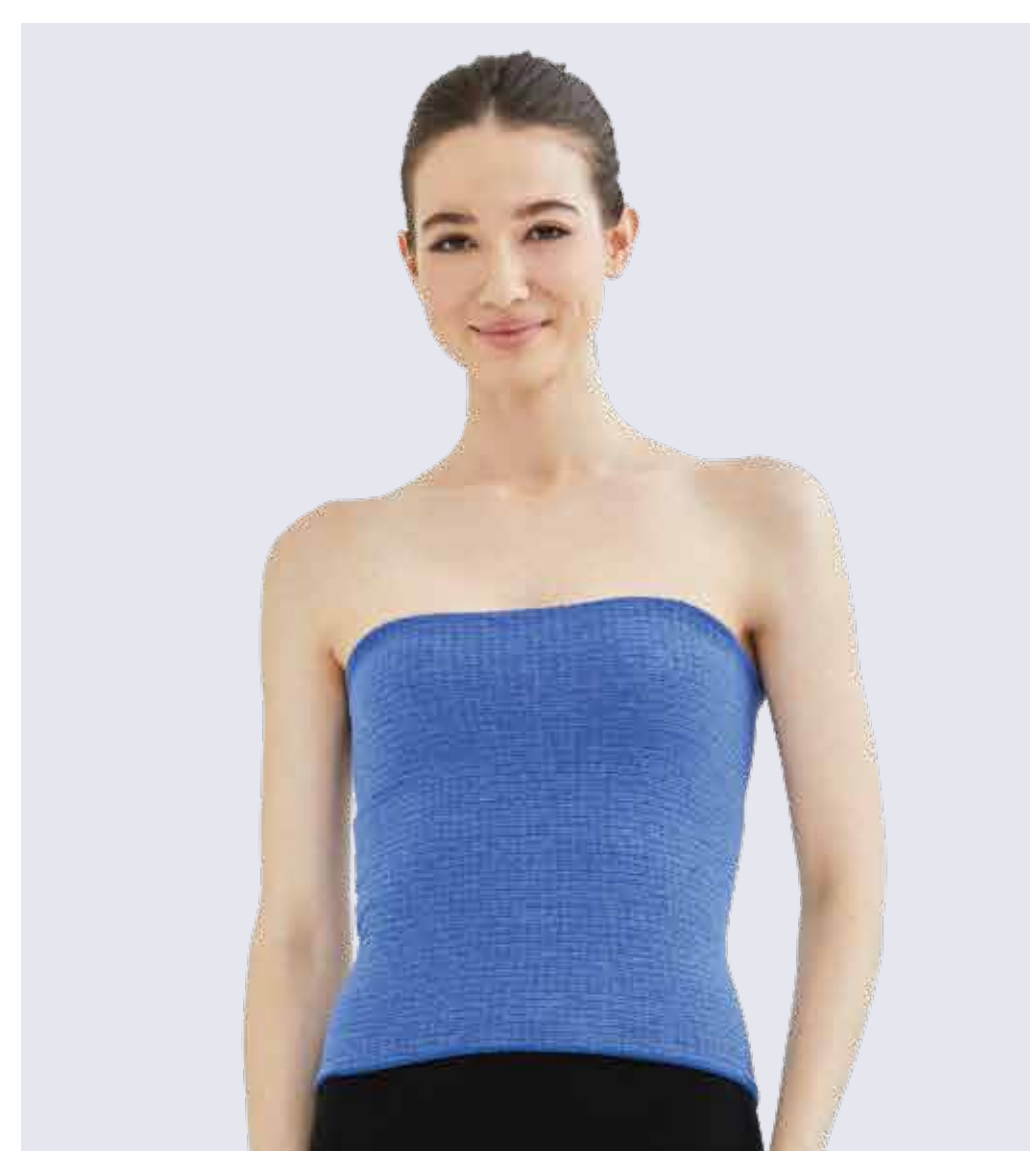
AS012 NEORON® Body Wrap