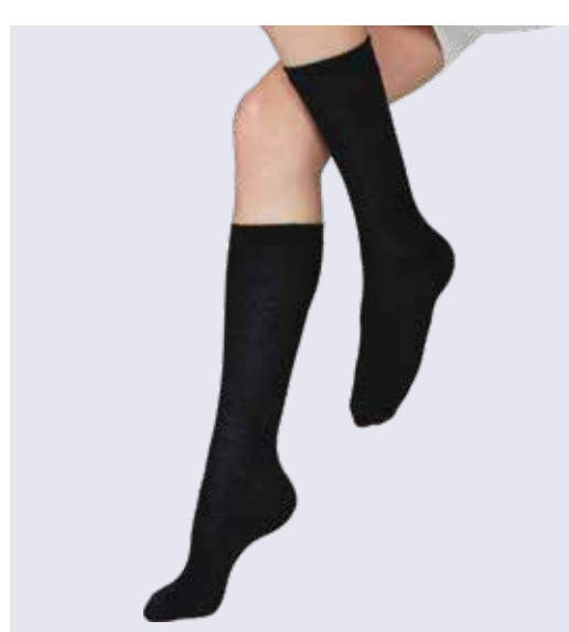
LS004 Long Socks

^ Net payable amount: approximately RM4,860