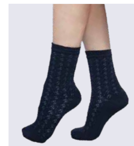
LS005 Room Socks