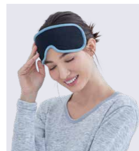
AS025 Eye Mask