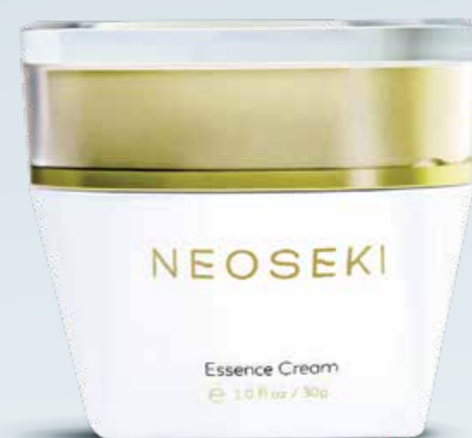
BW103 Essence Cream - 30g