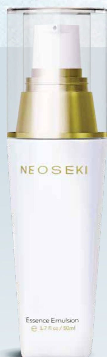
BW102 Essence Emulsion - 50ml