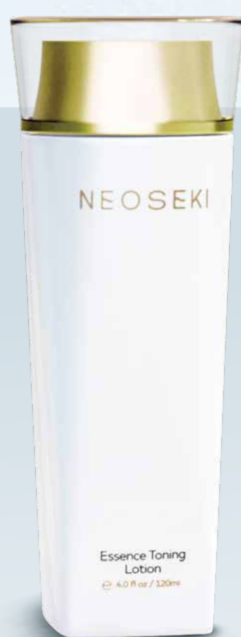
BW101 Essence Toning Lotion - 120ml