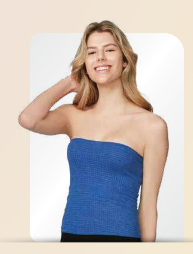
AS012 NEORON® Body Wrap

Min. Requirement: SV5,400<sup>^</sup> ^Net payable amount: approximately RM4,860