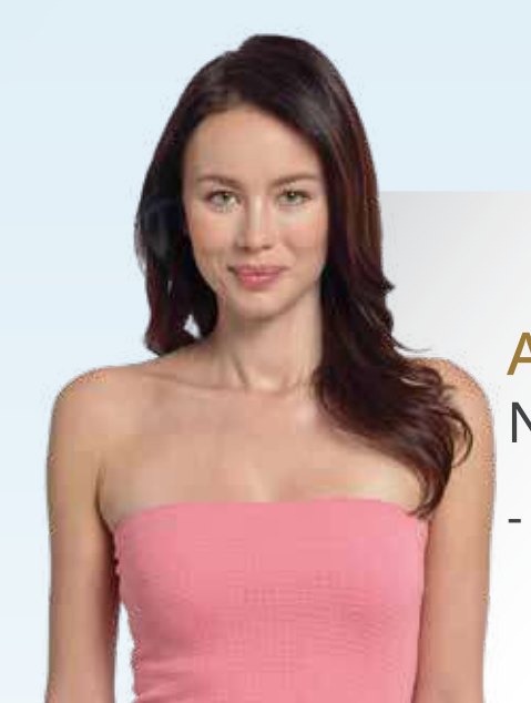
AS012 NEORON® Body Wrap Pink, 70cm x 27cm