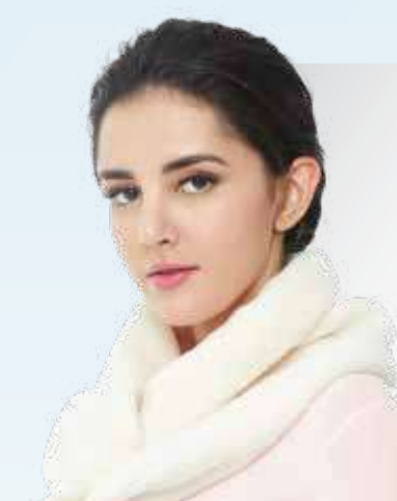
AS028 Elegant Neckwarmer