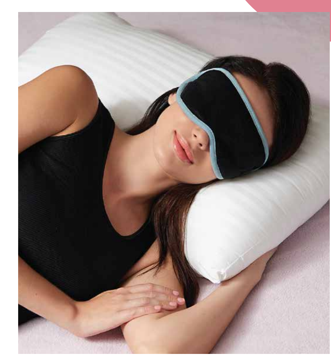
AS025 Eye Mask