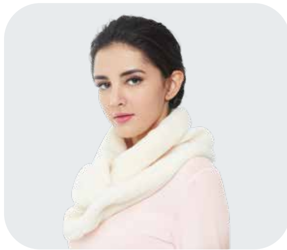
AS028 Elegant Neckwarmer