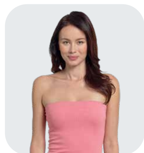
AS012 NEORON® Body Wrap