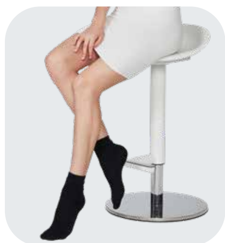
LS002 Lady's Rib Socks