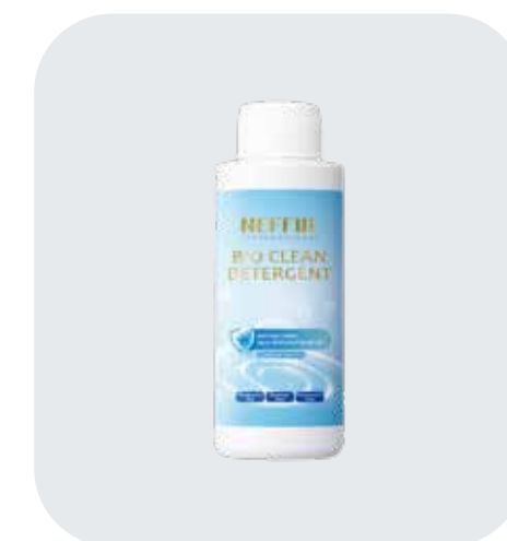
NS0016 Bio Clean Detergent