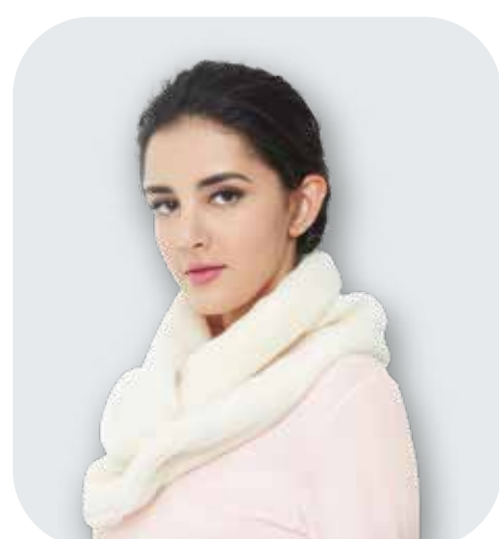
AS028 Elegant Neckwarmer