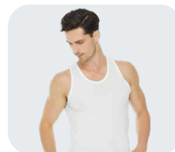
UW182 Men's Sleeveless Undershirt