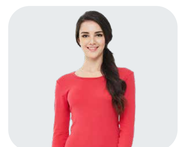
UW623 Lady's Long-Sleeve Shirt