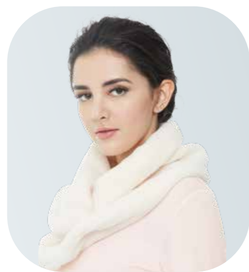
AS028 Elegant Neckwarmer - Ivory, 21cm x 88cm

Min. Requirement: SV20,000 ^ ^ Net payable amount: approximately RM18,000