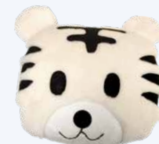
NOT FOR SALE SA803 Lucky Tiger - Ivory *While stock last