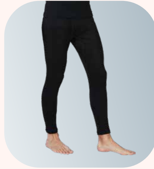
UW159 Men's Long Underpants - Black