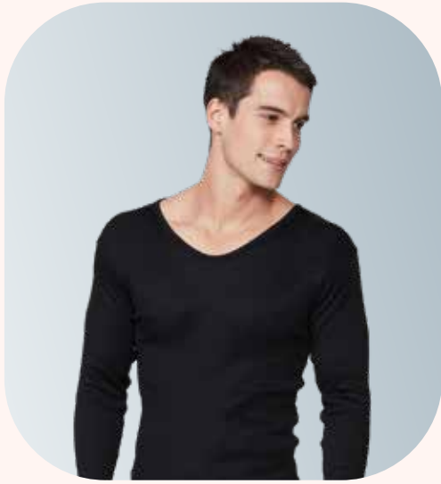
UW158 Men's Long-Sleeve Undershirt - Black