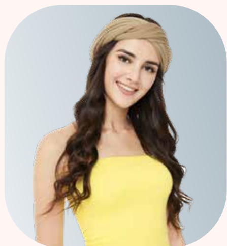
AS034 Chiffon Shawl - Olive, 170 x 79cm