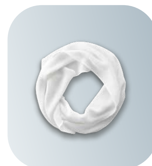
AS001 Cloth (2 Per Pack) - White, 60 x 17cm