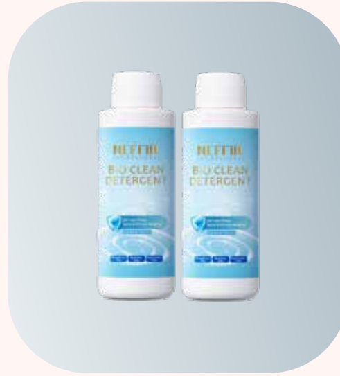
2x NS0016 Bio Clean Detergent - 125ml