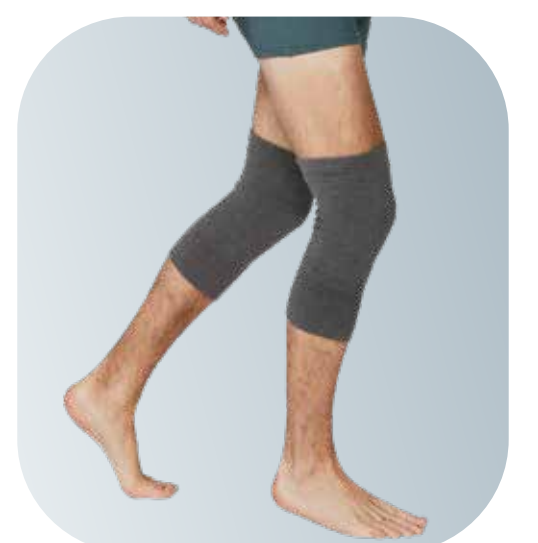
SG012 Knee Support (1 Pair/Pk) - Gray, M or L

NEFFUL (MALAYSIA) SDN BHD (200601007191)(AJL 931652)