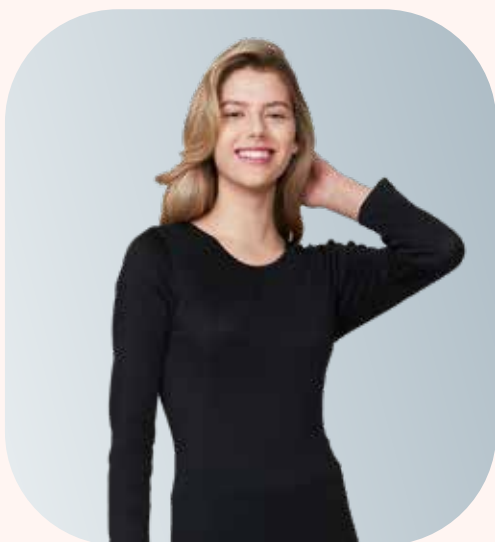
UW156 Lady's Long-Sleeve Undershirt - Black