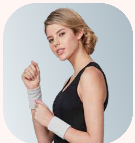
AS016 Wrist Bands - Gray, M