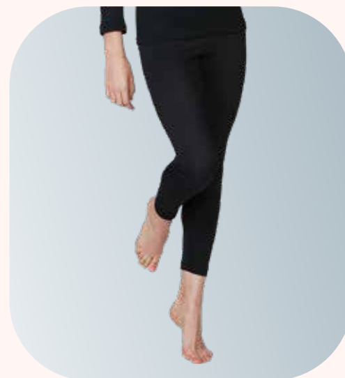
UW157 Lady's Long Underpants - Black