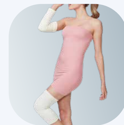
SG001 Dual Purpose (Elbow/Knee) Support (1 Pair/Pk) - Ivory, M