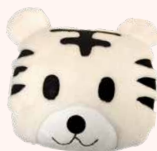
NOT FOR SALE SA803 Lucky Tiger - Ivory *While stock last