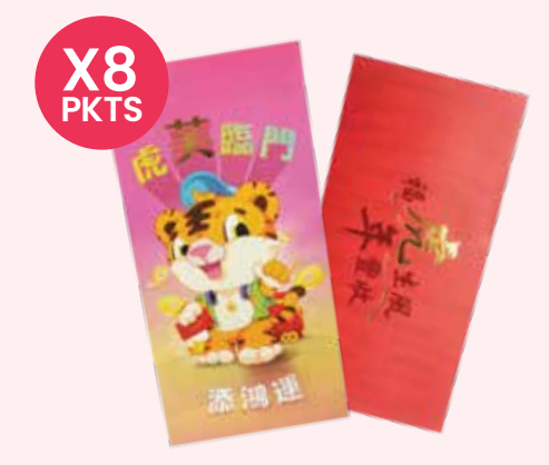
Red Packet 2022 (Limited Edition)