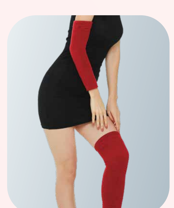
SG001 Dual Purpose (Elbow/Knee) Support (1 Pair/Pk)