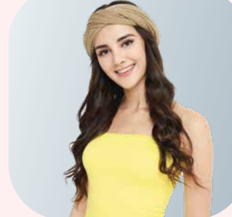
AS034 Chiffon Shawl