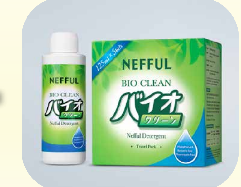
NS005 Bio Clean Travel Kit