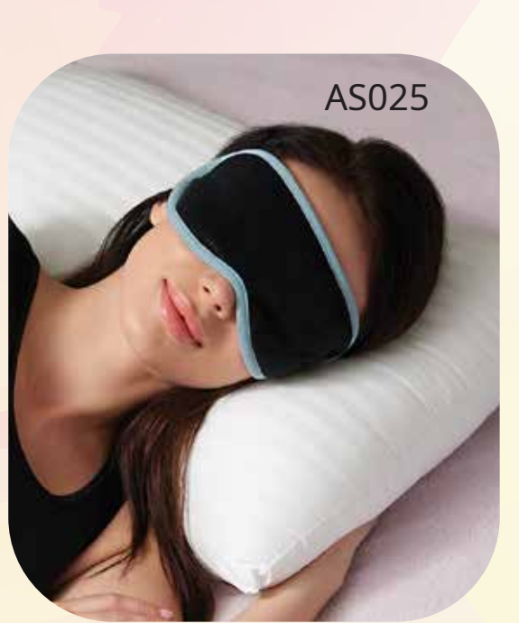
AS025 Eye Mask

UW401 Thermal Long-Sleeve Undershirt (Unisex) - Gray, M or L