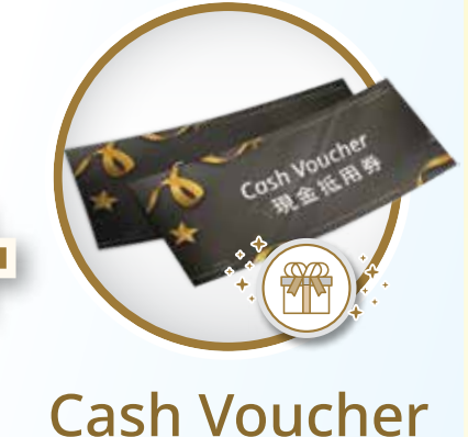
Cash Voucher - worth of RM450