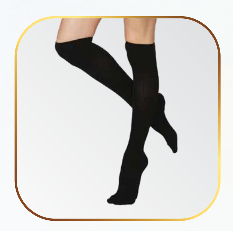
LS006 Full Length Circulation Socks