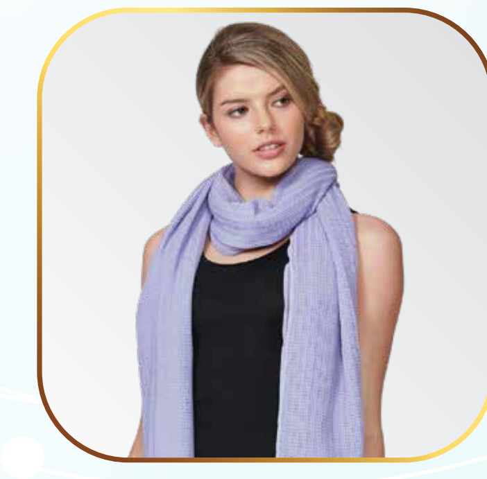
AS005 Shawl - Lavender, 185 x 73cm