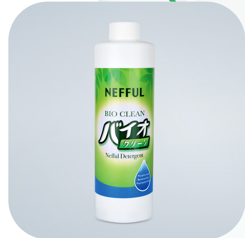
NS02 Bio Clean Detergent - 500ml