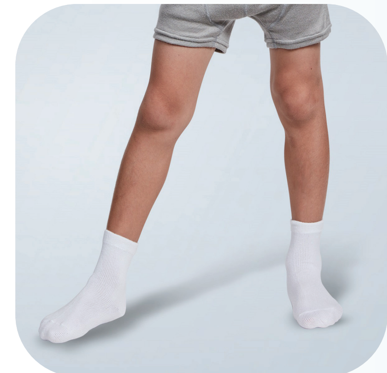
LS013 Children's Socks - White, 16cm-18cm