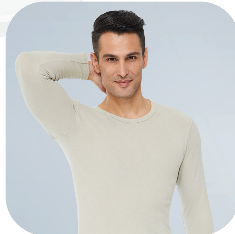
UW316 Men's Long-Sleeve Undershirt - Beige, M