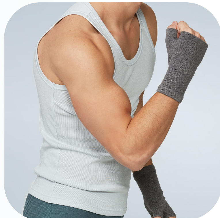
SG013 Wrist Support (1 Pair/Pk) - Gray, M