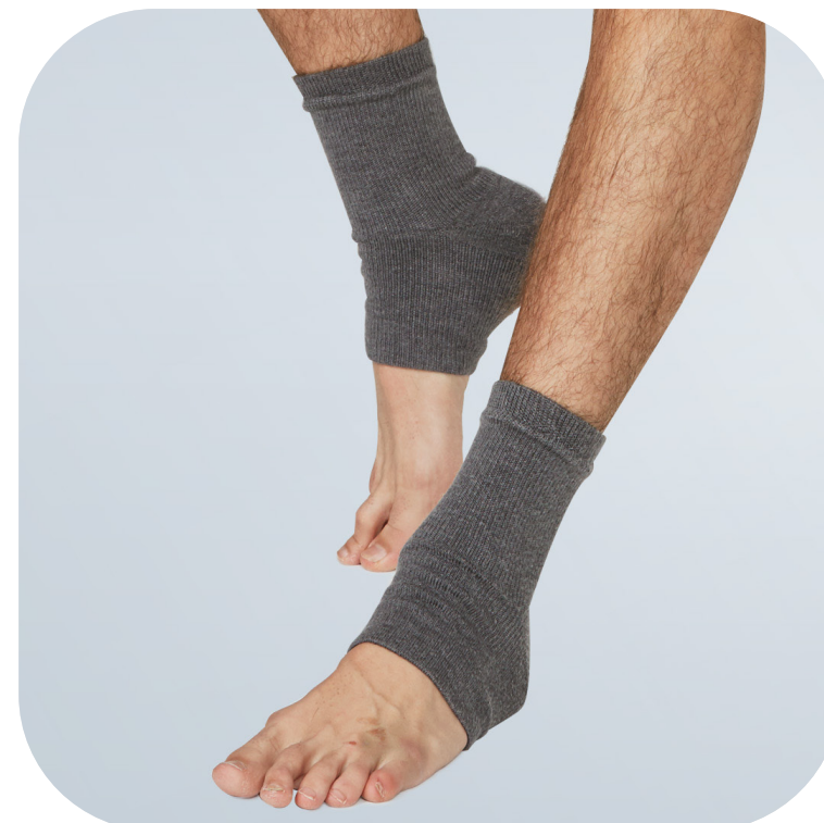
SG014 Ankle Support (1 Pair/Pk) - Gray, L